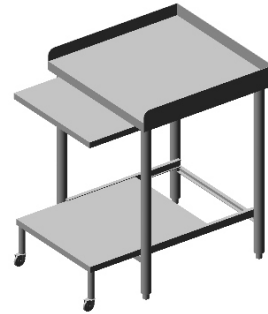
Model No. STD2424-C Stainless Steel Rice Cooker Stand w/Sliding Shelf 24" (Width) x 24" (Depth) x 34" (Height)