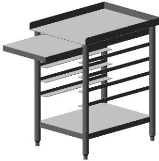
Model No. STD2128-C Stainless Steel Steamer Stand 21" (Width) x 28" (Depth) x 34" (Height)